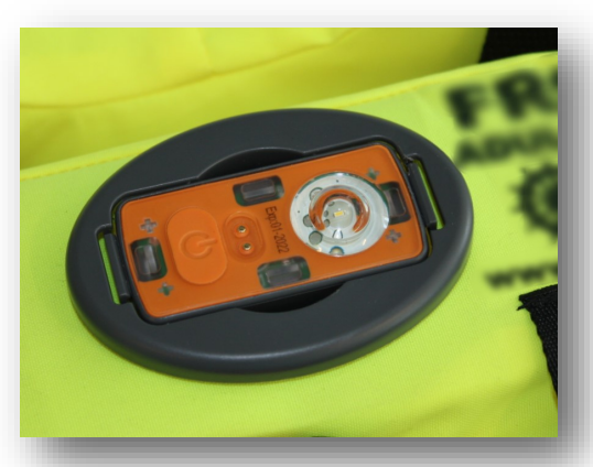
Recessed mounted example