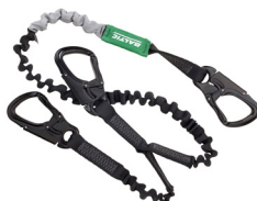
Article number: 0133